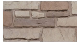
Rocky Mountain Clay