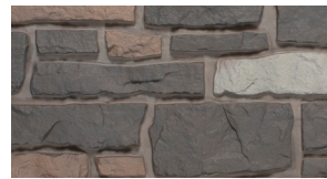
Bucks County Gray